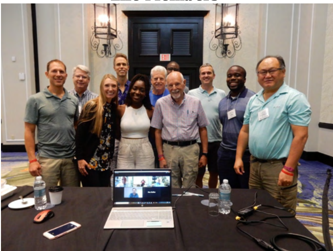
Board Members.....In person and on zoom