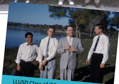
LLUSD Class of '59 - reps to NASDAD, October 1958 in Dallas, Texas